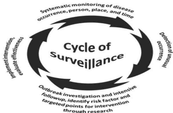
Fig 3: The surveillance cycle for investigating infectious diseases

The emerging zoonotic pathogens are a challenge to